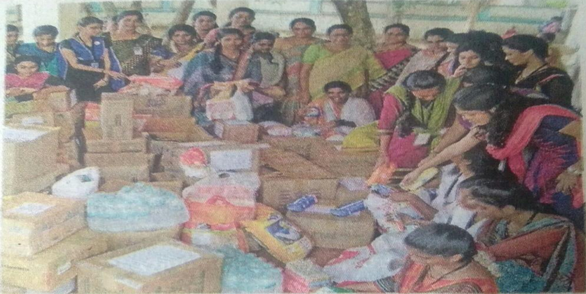
Students of Bhaktavatsalam memorial college for women in Korattur pack relief materials worth ₹2 lakh for Gaja cyclone victims.