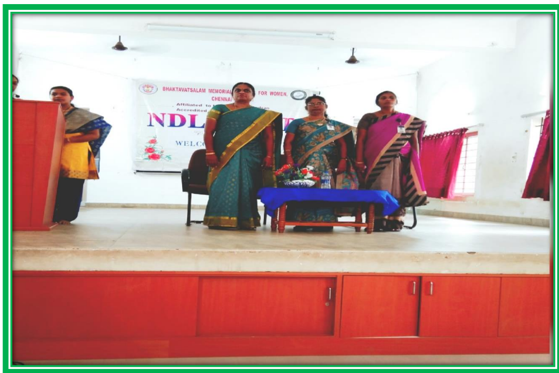
DIGNITARIES ON DAIS- - I