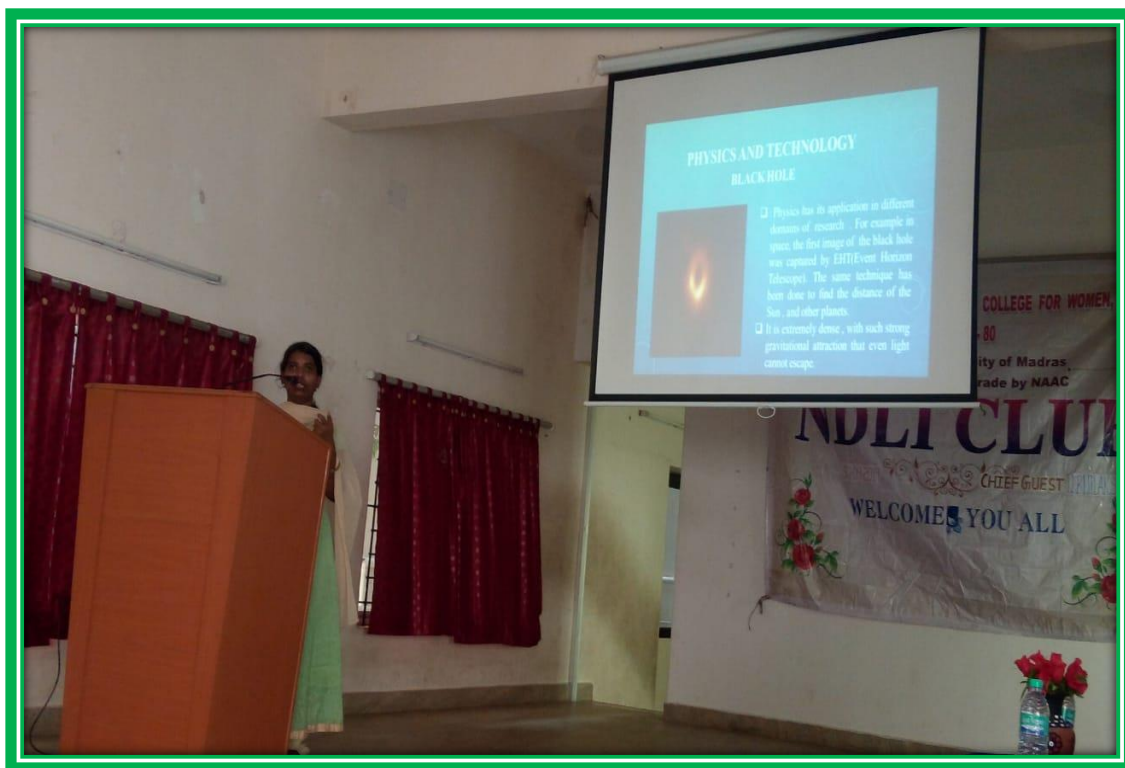
METICULOUS PRESENTATION BY THE PARTICIPANT