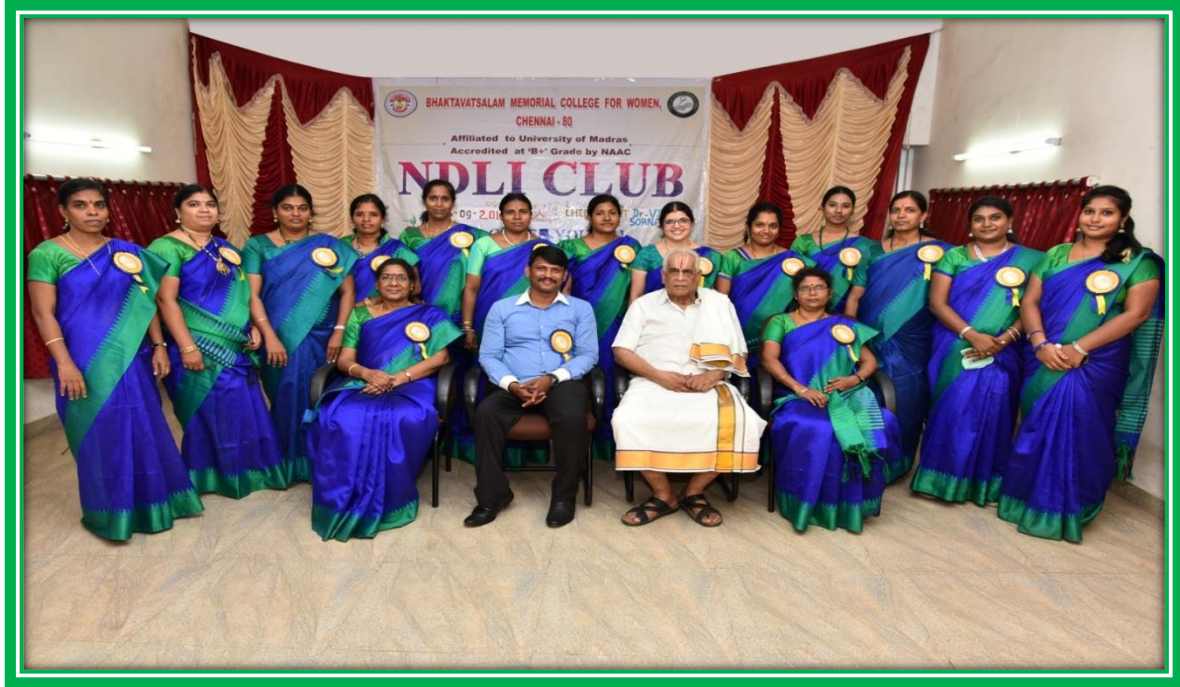
NDLI CLUB MEMBERS OF BMC