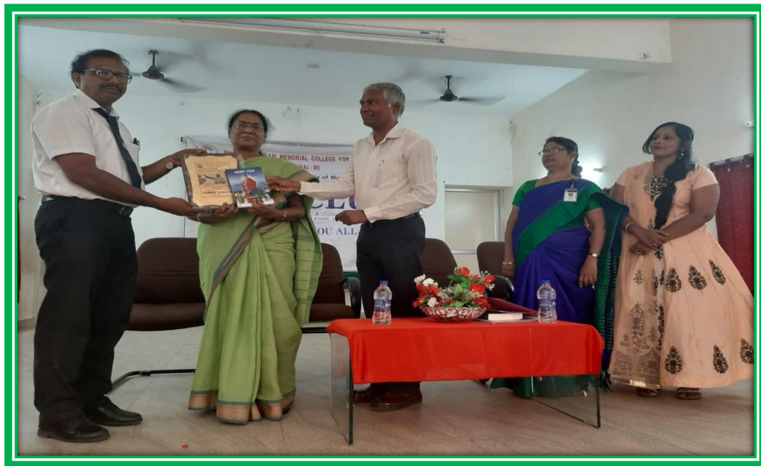
MOMENTO PRESENTED TO PRINCIPAL