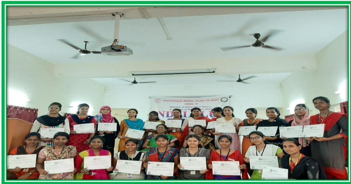
WINNERS OF THE CONTEST