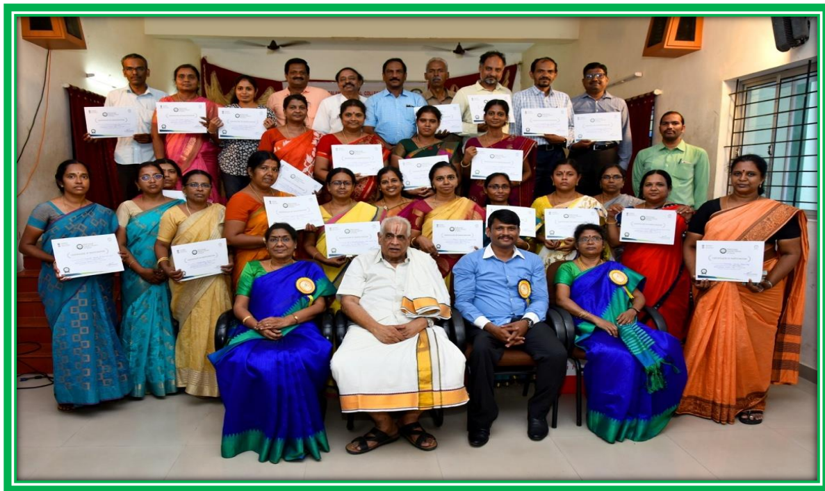
WORKSHOP PARTICIPANTS FROM OTHER CITY COLLEGES