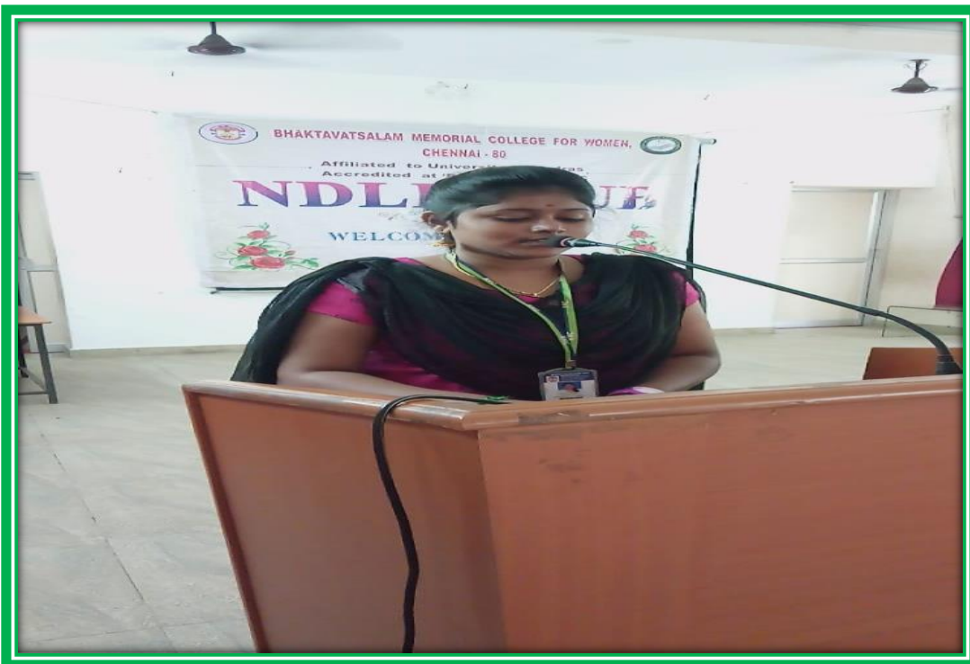
PRESENTATION OF BEST BOOK REVIEW BY STUDENT