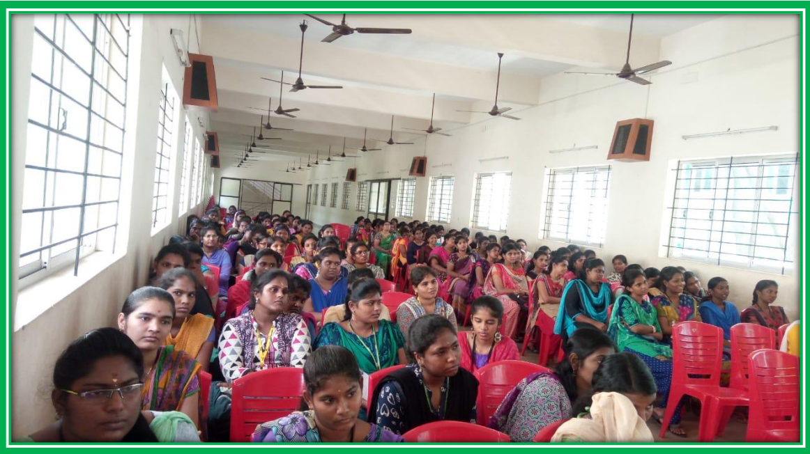
AN ENTHRALLED AUDIENCE