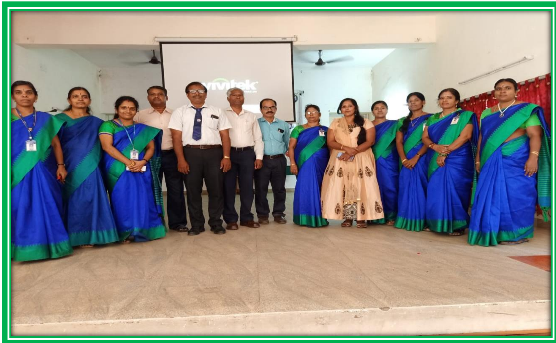
NDLI CLUB MEMBERS WITH CHIEF GUEST