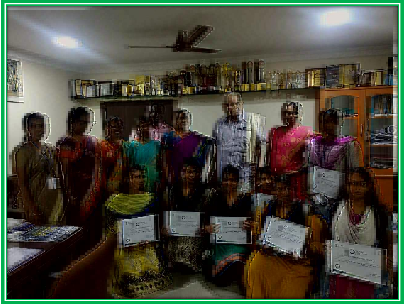
GROUP DISCUSSION WINNERS