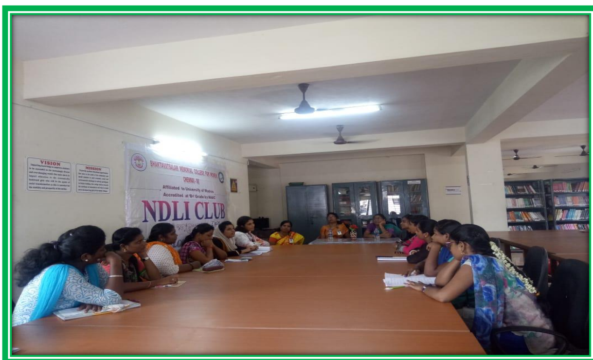
ENTHUSIASTIC PARTICIPANTS OF THE GROUP DISCUSSION