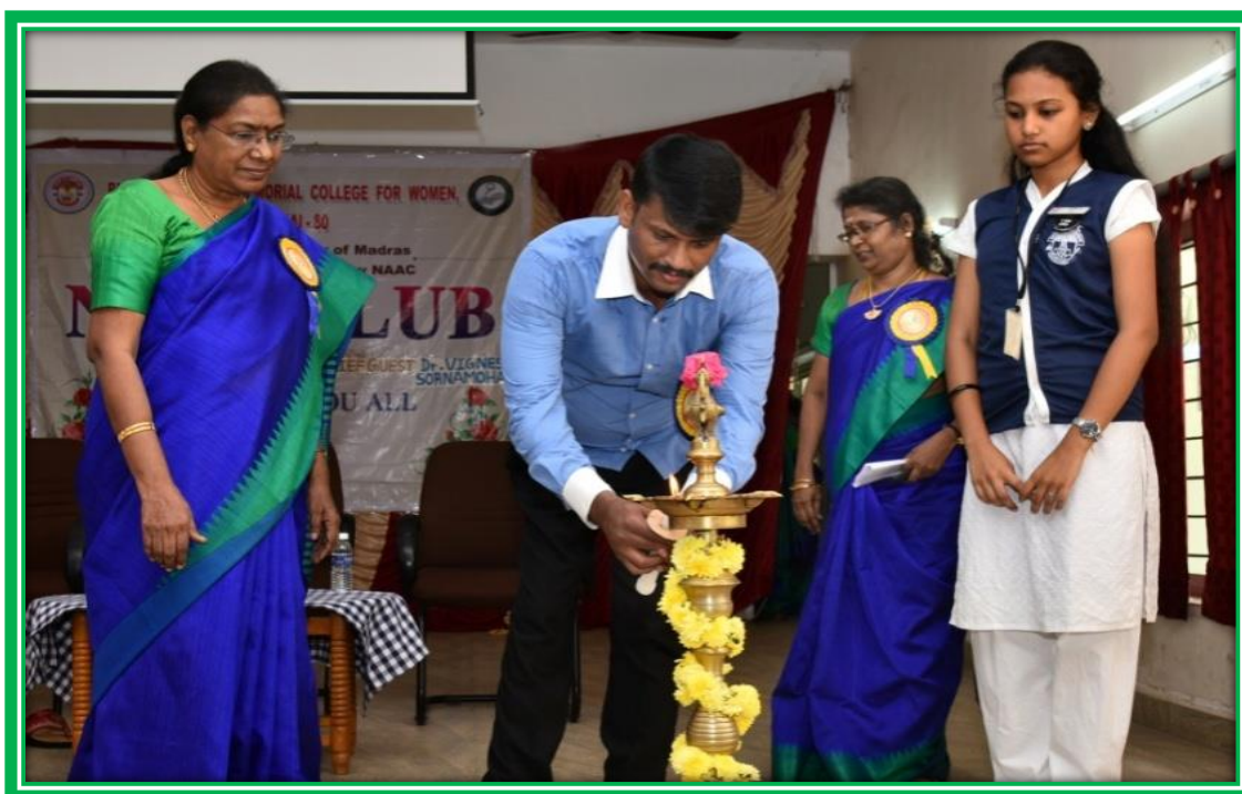
LIGHTING THE LAMP BY CHIEFGUEST