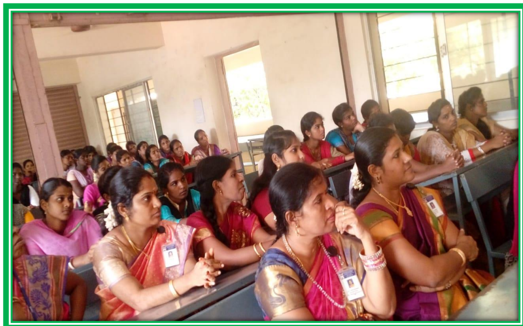
ATTENTIVE STUDENTS AND STAFF OF THE PROGRAMME