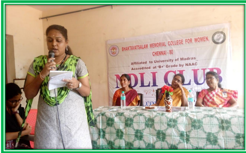
THOUGHT PROVOKING PRESENTATION BY DEBATE PARTICIPANT