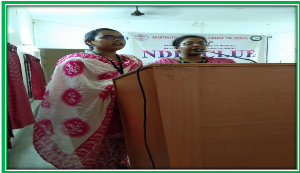
INVOCATION SONG BY STUDENTS