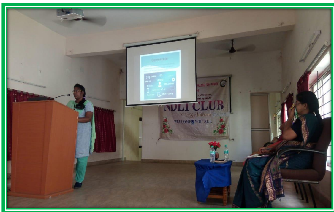
ENLIVENING PRESENTATION BY AN ENTHUSIASTIC PARTICIPANT