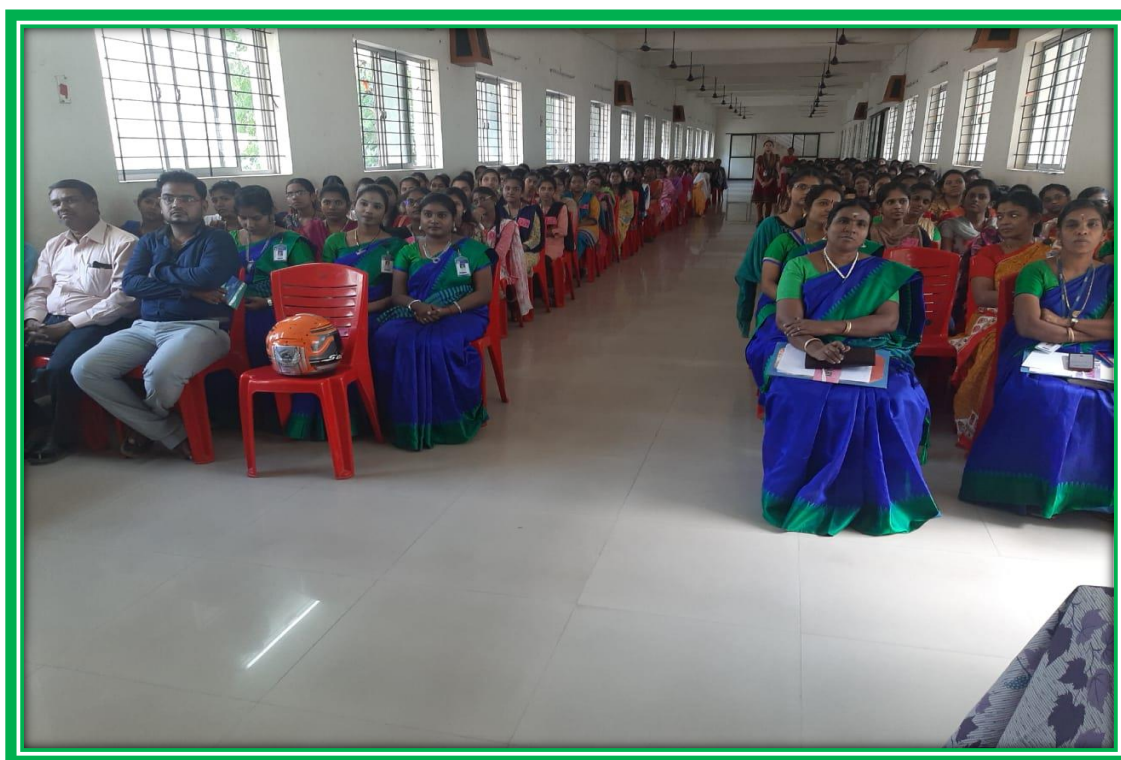
AUGUST GATHERING AT THE PROGRAMME