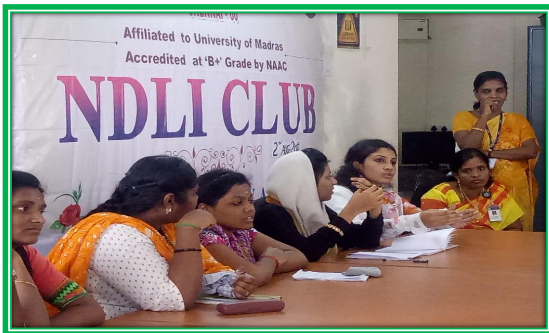
ACTIVE AND NOTABLE PRESENTATION BY PARTICIPANTS