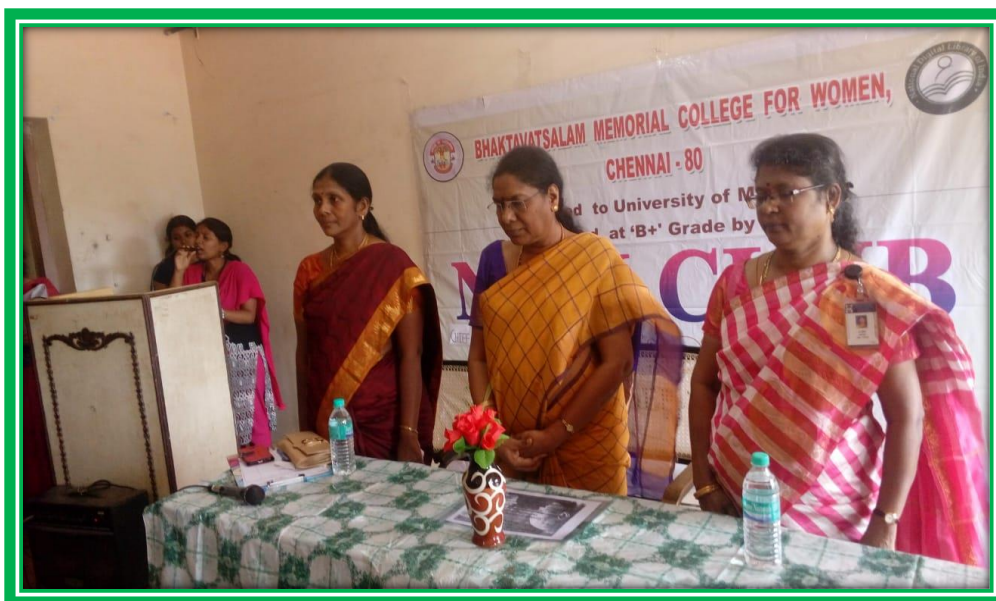
COMMENCEMENT OF DEBATE WITH INVOCATION