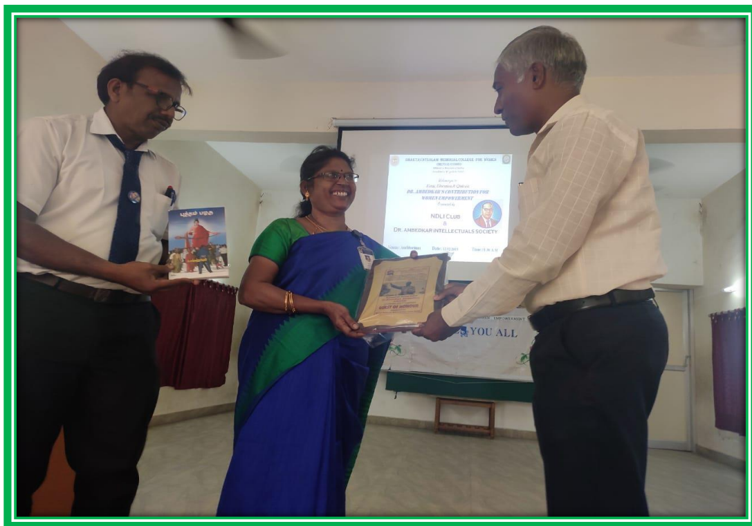
LIBRARIAN RECEIVED THE MOMENTO FROM THE CHIEF GUEST